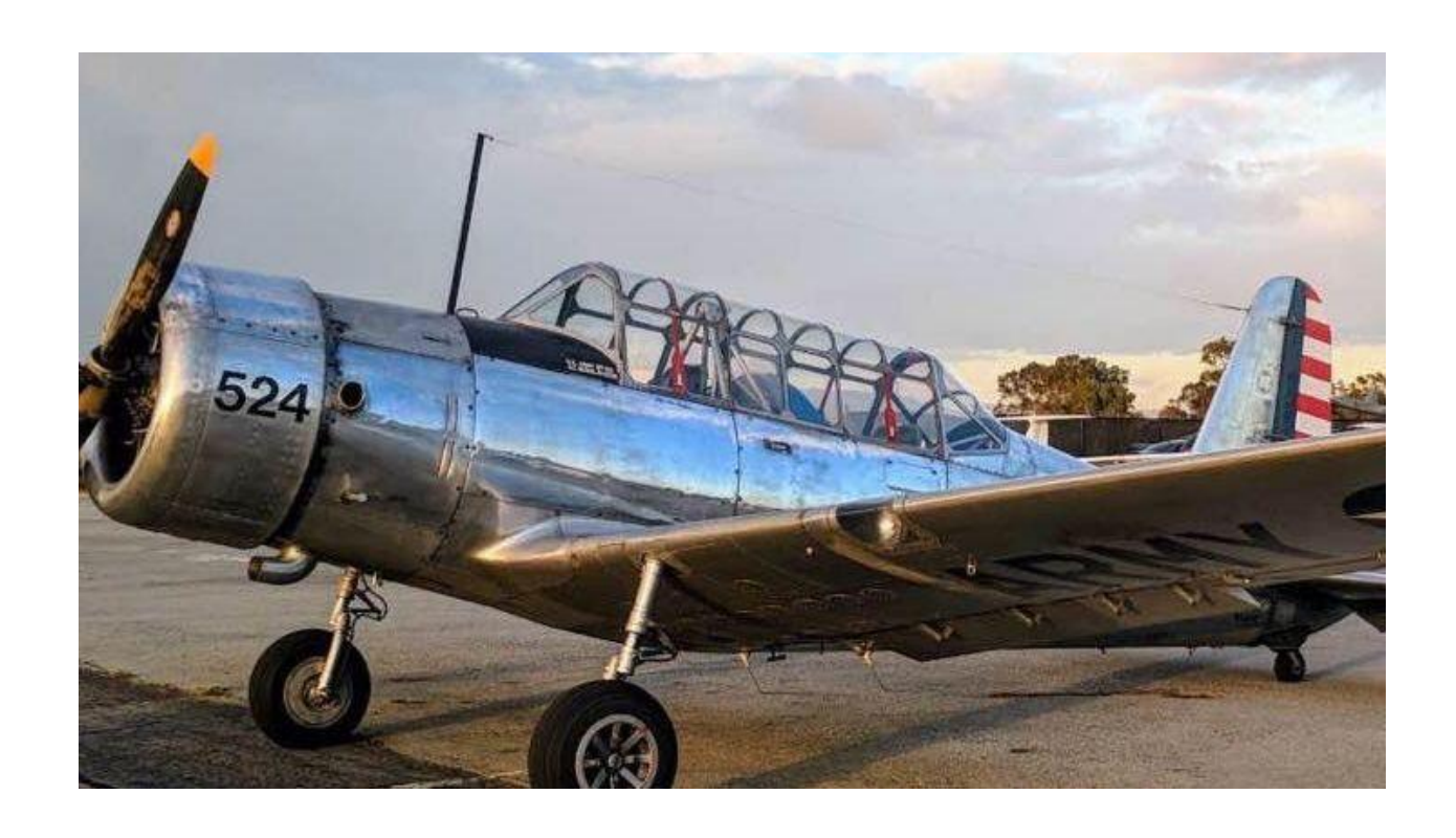
Support your local Annie!!